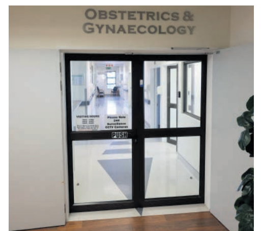
Midvaal Private Hospital now boasts its own state-of-the-art Maternity Ward.